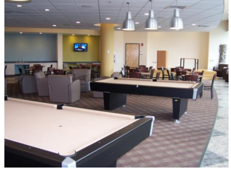
Picture of Café from second entrance overlooking pool tables