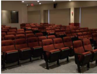
Picture of Theatre from side entrance