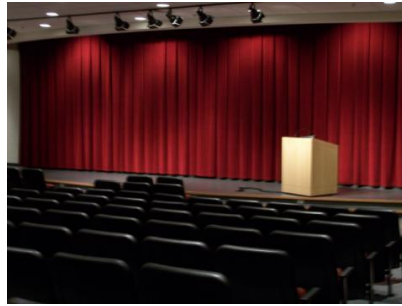
Picture of Theatre from back corner