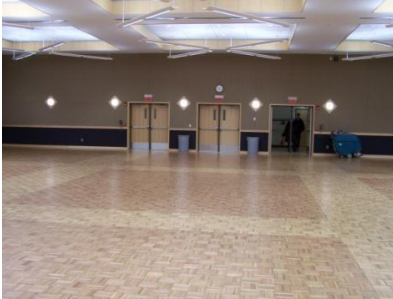
Betty Tipton Room from Stage