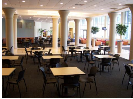
Picture of Lobby from Stage