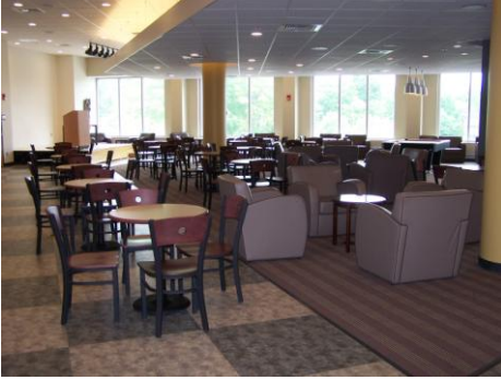
Picture of Café from entrance