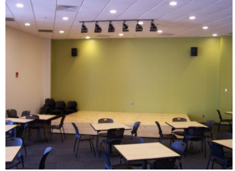
Picture of Lobby Stage from center

Please note that while the lobby is available to reserve, the area does not close for specific events