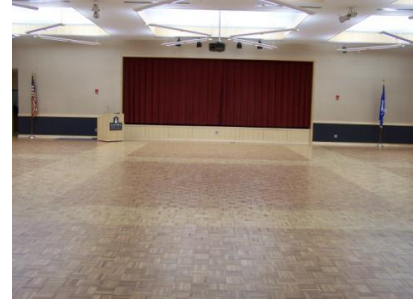
Betty Tipton Room from back