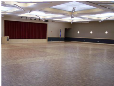
Betty Tipton Room from back corner