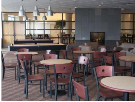
Picture of Café from back corner of room