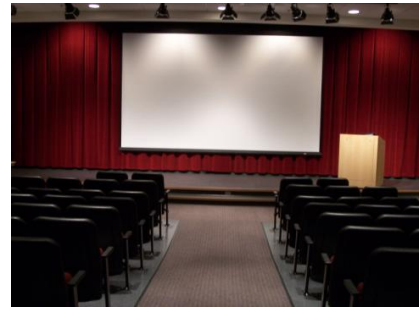
Picture of Theatre from back