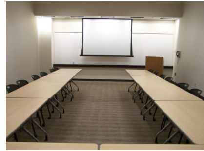
221 from back of room