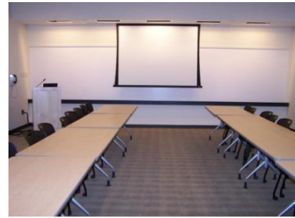
217 from back of room