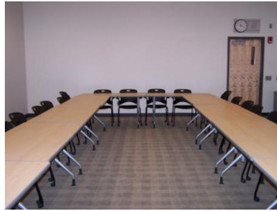
217 from front of room