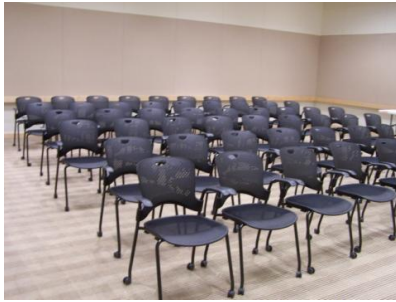
219 from entrance