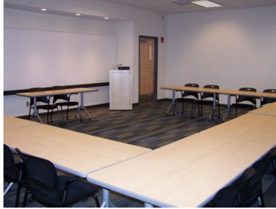
113 from back corner of room