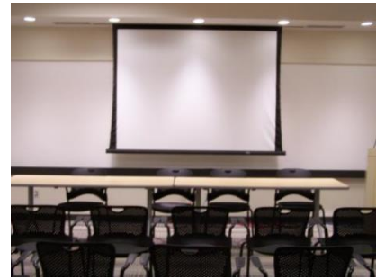
115 from back of room