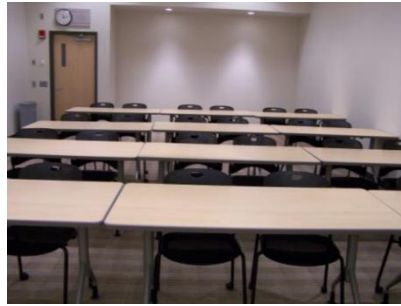
223 from front of room