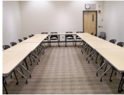
221 from front of room