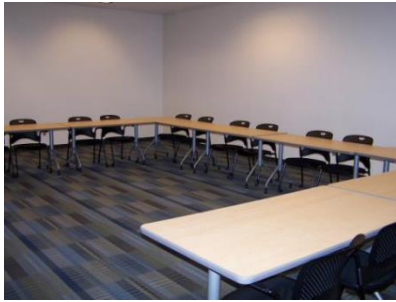
113 from entrance