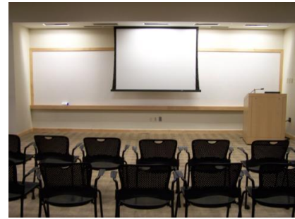
219 from back of room