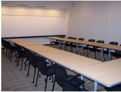
217 from entrance