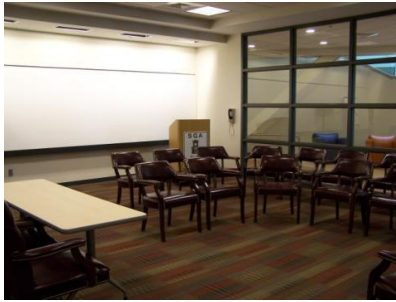
107 from entrance