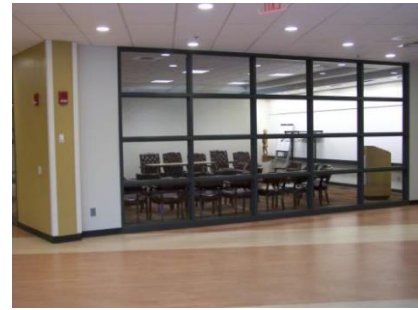
107 from the exterior of the room