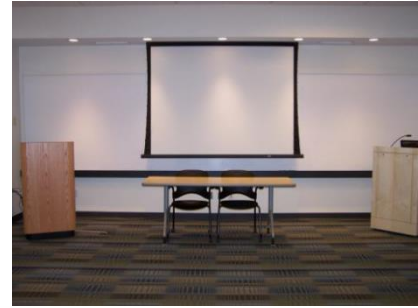
113 from back of room