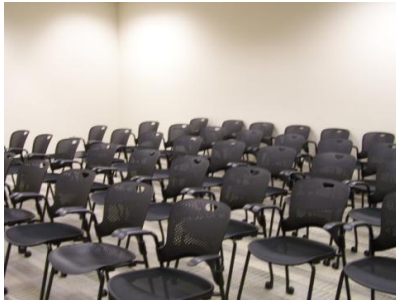
115 from entrance