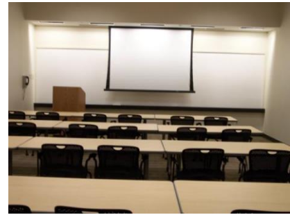
223 from back of room