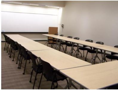
221 from entrance