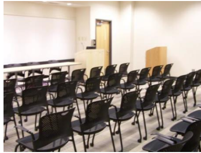
115 from back corner of room