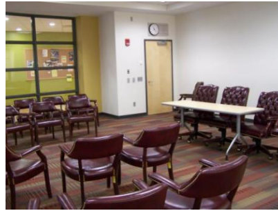
107 from back corner of the room