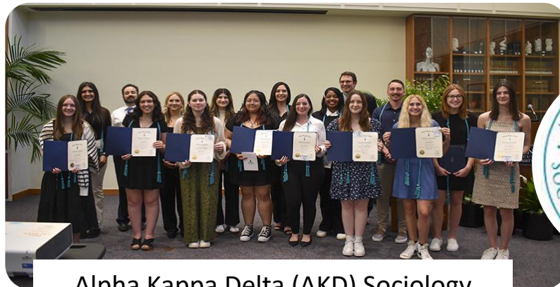
Alpha Kappa Delta (AKD) Sociology

http://www.easternct.edu/studentactivities/clubs-orgs/club-index/