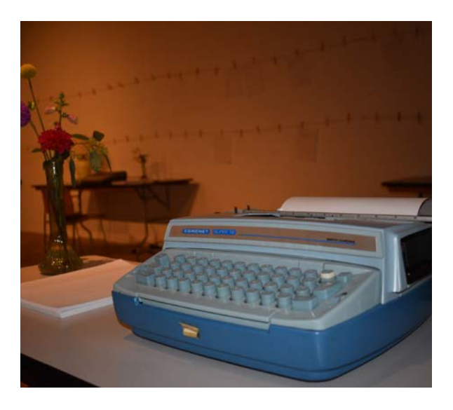
Typewriter at the event

literary journals, and talking to published authors about their new books.