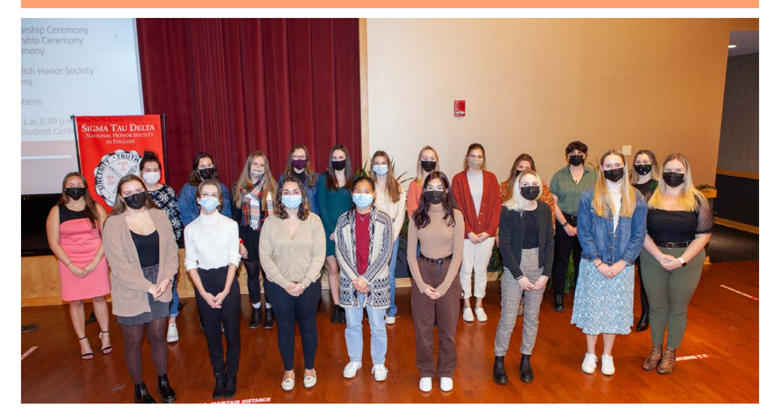
(Some of) the Fall 2021 inductees