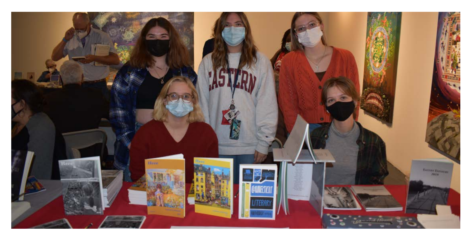
Creative Writing Club at CT Literary Festival