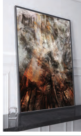
TOP: The Silent Bellow 6. BOTTOM LEFT: Sculpted by Time 2. BOTTOM RIGHT: The Silent Bellow 1.