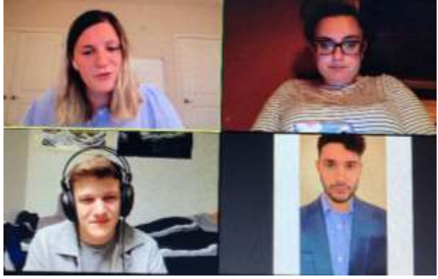
Internet Marketing & Social Media Web Design