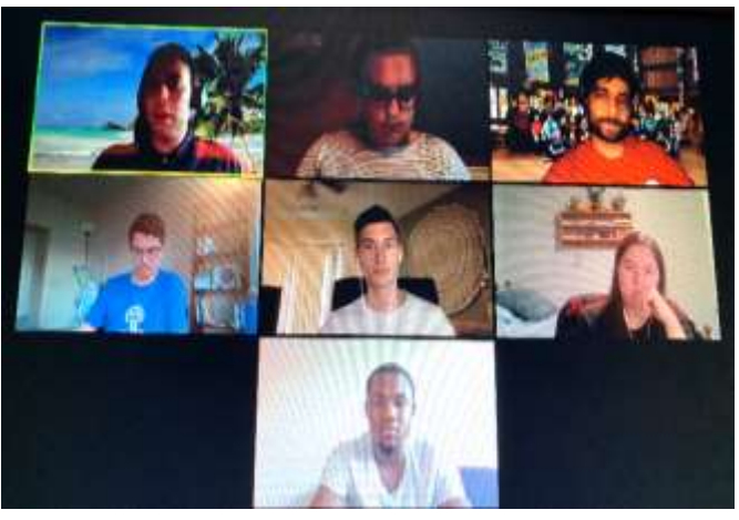
Cyber Security & Network Administration