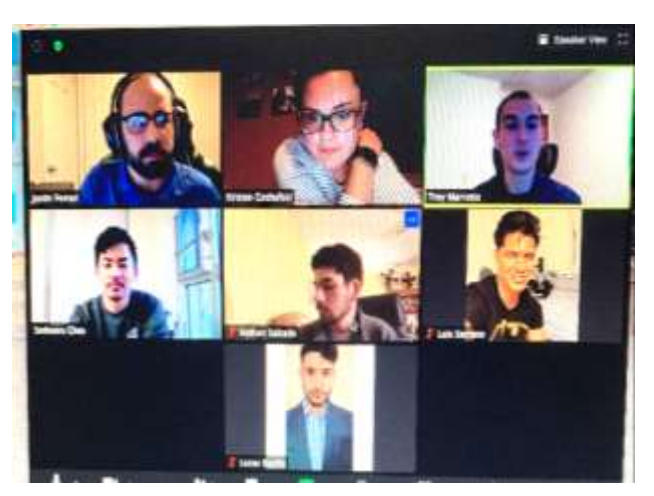
Cloud Services - Operations Management

On Tuesday, October 6<sup>th</sup>, 2020, students, alumni and faculty gathered to attend the career conversations event with alumni and representatives from Cigna, Travelers, Pratt & Whitney, RMI Corp., Webster Bank, The Hartford, Aetna, Harford Steam Boiler, and RecDesk Software. The event lasted almost 3 hours and began at 5:00 pm. Attendees were divided into 9 breakout rooms with 21 accompanying alumni and company representatives, divided by alumni career areas of expertise. There were breakout rooms setup for students specifically looking to find out more about careers in application development, business intelligence analytics/big data mining, business/system analytics, cloud services, cyber security & network administration, database administration, healthcare IS/ITS, internal marketing, project management, and several others. Students could visit multiple Biz-Tech Career Area Breakout Rooms, during the three-hour come n' go format. This event is jointly sponsored by the BIS-AITP Student Chapter, Center for Internship and Career Development and the BIS Program. (See Flyer & Alumni Positions - Page 3)