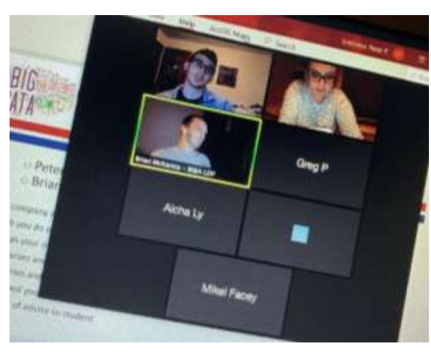
Business Intelligence & Analytics