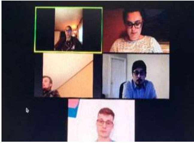
Database, SQL & Data Architecture