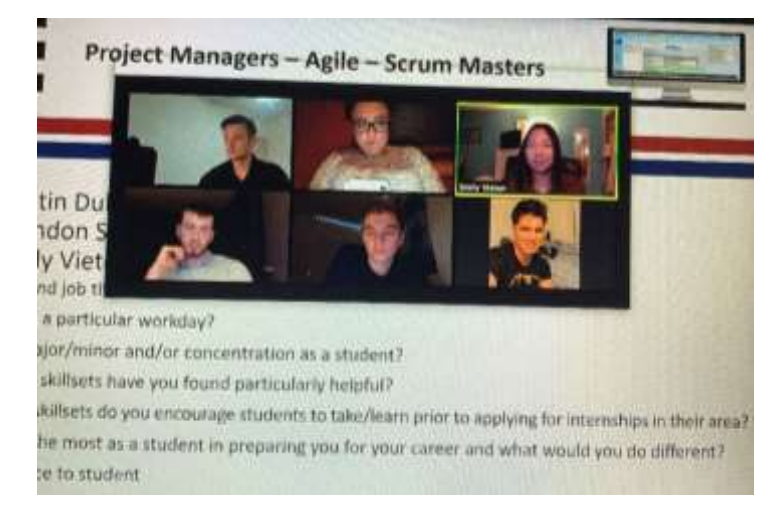
Project Managers – Agile – Scrum Masters