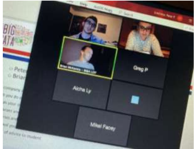
Business Intelligence & Analytics