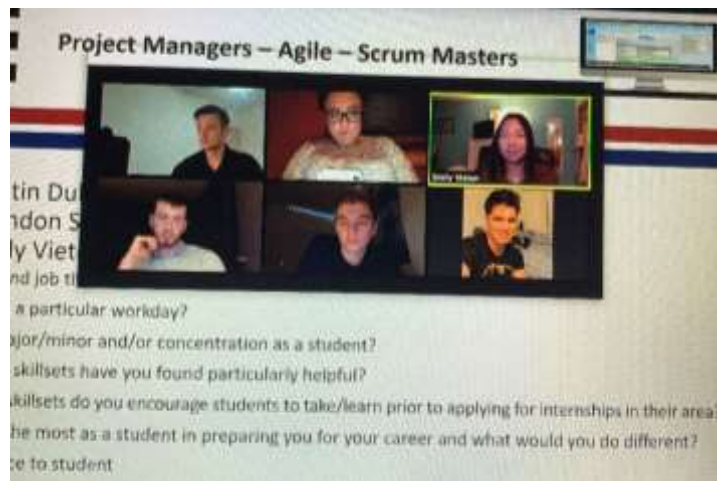
Project Managers – Agile – Scrum Masters