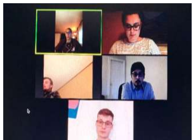
Database, SQL & Data Architecture