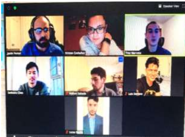
Cloud Services – Operations Management

On Tuesday, October 6 th , 2020, students, alumni and faculty gathered to attend the career conversations event with alumni and representatives from Cigna, Travelers, Pratt & Whitney, RMI Corp., Webster Bank, The Hartford, Aetna, Harford Steam Boiler, and RecDesk Software. The event lasted almost 3 hours and began at 5:00 pm. Attendees were divided into 9 breakout rooms with 21 accompanying alumni and company representatives, divided by alumni career areas of expertise. There were breakout rooms setup for students specifically looking to find out more about careers in application development, business intelligence analytics/big data mining, business/system analytics, cloud services, cyber security & network administration, database administration, healthcare IS/ITS, internal marketing, project management, and several others. Students could visit multiple Biz-Tech Career Area Breakout Rooms, during the three-hour come n' go format. This event is jointly sponsored by the BIS-AITP Student Chapter, Center for Internship and Career Development and the BIS Program. (See Flyer & Alumni Positions - Page 3)