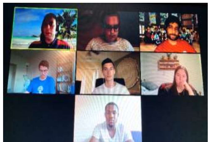
Cyber Security & Network Administration