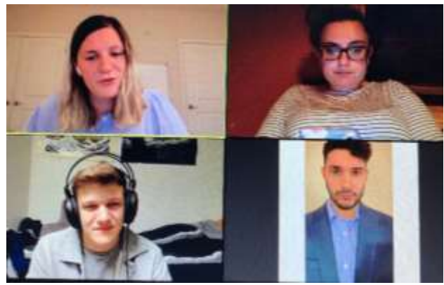
Internet Marketing & Social Media Web Design