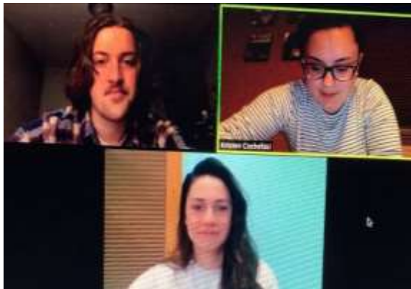
Other Biz-Tech Careers