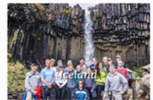
Faces and Places (Example 2)