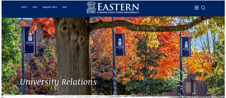
Image size: Landing Page 1920x745 or Interior Page 950x490 pixels.

Banner heading text should be short and intuitive (“University Relations”; not “Office of University Relations”). The photo should convey the nature of the department, office or service.