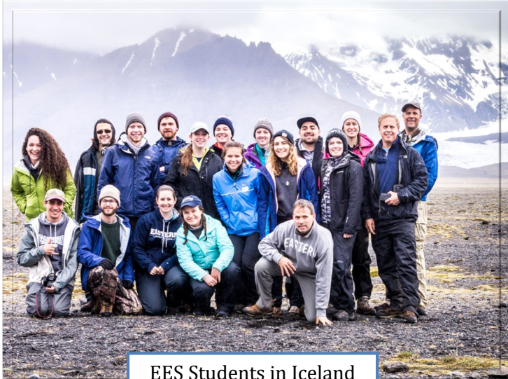
EES Students in Iceland