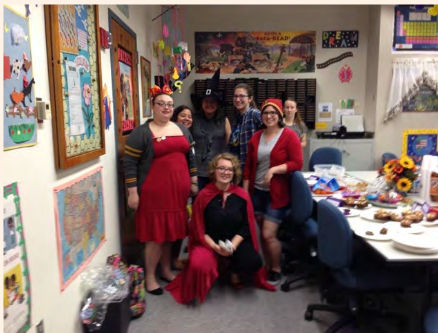
Member of Sigma Tau Delta at Harry Potter Night

After the moderate level of book donations, Sigma