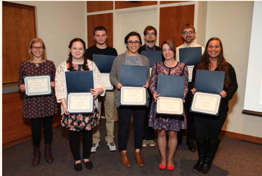
All the English Night Award Recipients

After each seminar were brief question and answer sessions where students could elaborate on what they learned after their two-semester seminar sequence.