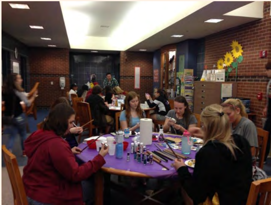
Harry Potter fans enjoying Potter-themed activities

If you would like to support Sigma Tau Delta in another way besides a t-shirt, perhaps you would be