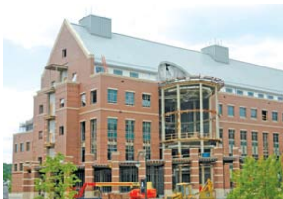
The 173,000-square-foot Science Building is being built to U.S. Green Building Council certification standards.

In late 2005, construction workers broke ground on the new $46 million Science Building, which will consolidate all of Eastern's science and mathematics departments into one 173,509-square-foot facility. The building, which will meet U.S. Green Building Council certification standards, continues to take shape west of the J. Eugene Smith Library. It is expected to be finished in fall 2008. Five floors will be dedicated for academic departments, including biology, computer sciences, environmental earth science, math, and physical sciences. The building also will house a 150-seat lecture hall with state-of-the-art audiovisual systems; a computer science suite; and the Microscopy Center.