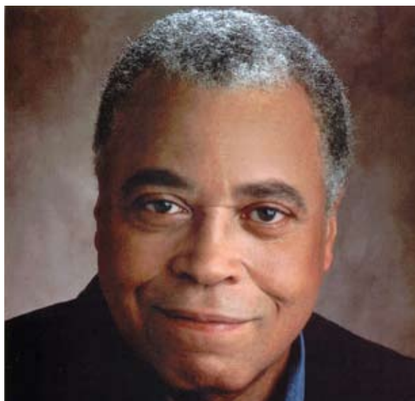
James Earl Jones entertained a sell-out crowd in October 2006, using his famous voice and stage presence to recite passages from several Shakespearean plays.

Scientist, educator, comedian, and author " Bill Nye the Science Guy " encouraged a packed Francis E. Geissler Gymnasium audience on Nov. 16, 2006, to "never lose sight of the passion, beauty, and joy of science!" More than 2,000 people, many of them schoolchildren, filled the gym to give Nye a standing ovation when he arrived.