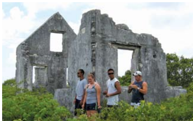
Tropical Biology students explore the ruins of an 18th century British Loyalist cotton plantation on San Salvador.