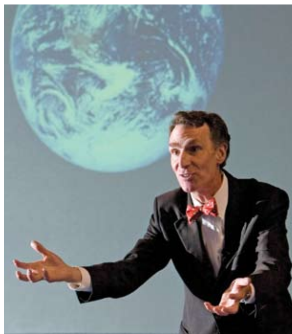
"Bill Nye the Science Guy" entertained and informed his Francis E. Geissler Gymnasium audience with photos of Mars; facts about global warming; and his trademark admonition to "CHANGE THE WORLD!"