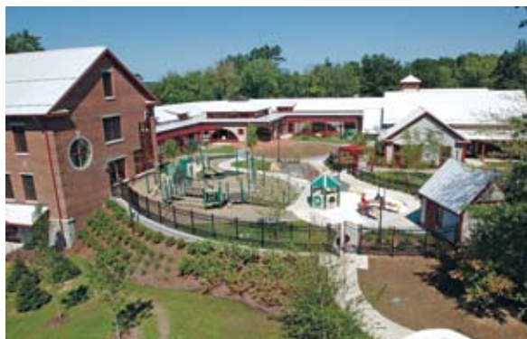
The Margaret S. Wilson Child and Family Development Complex opened in February 2006, complete with state-of-the-art instructional technology. The preschool wing can accommodate up to 90 children, while the classroom building provides instruction for tomorrow's early childhood teachers.

court; a greatly expanded bookstore; a renovated Betty Tipton Room with capacity for 400 people; eight conference and meeting rooms; and offices for student clubs and organizations.