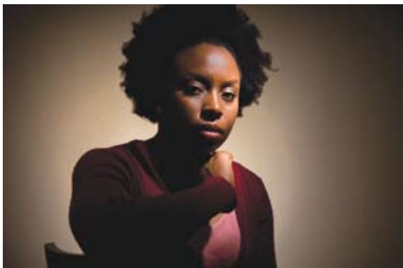
Award-winning novelist Chimamanda Ngozi Adichie '01

Half of a Yellow Sun , the new novel by Chimamanda Ngozi Adichie '01 , was favorably reviewed in the Sept. 18, 2006 issue of People magazine. The magazine called Half of a Yellow Sun "powerful," and said Adichie "masterfully" crafts a narrative that is full of "memorable characters." Adichie's first novel, Purple Hibiscus , was published in 2003, and met with critical acclaim and several international awards. She also received the Eastern Alumni Association's 2004 Distinguished Alumni Award.