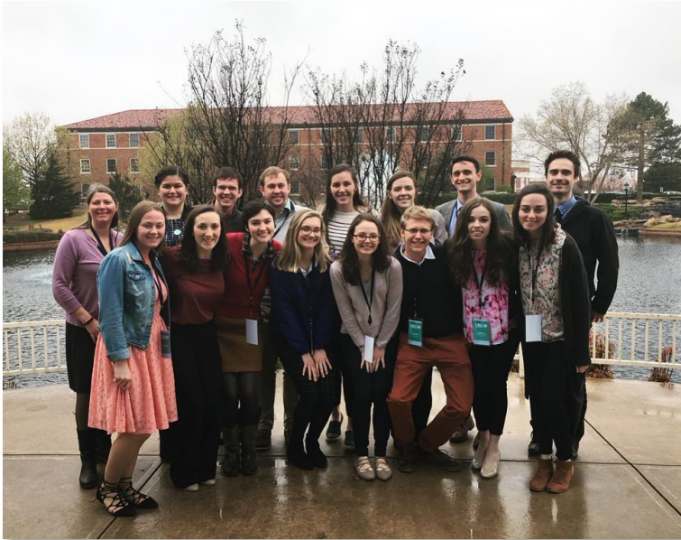
Group photo taken at the NCUR Conference.

tions during their respective Q&A sessions. My presentation of my honors thesis, “Juvenilism: A New Theoretical Perspective on the Origins and Mechanics of Contemporary Literary Portrayals of Children,” encouraged a discussion of various literary portrayals of youth in popular culture. The presentation left me with the sense of validation that any undergraduate student researcher hopes to find when presenting their research to their peers.