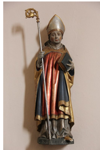
A statue of St. Willibald