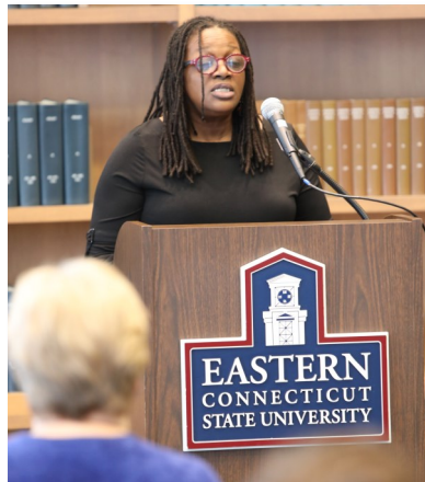
Rhonda Ward, Poet Laureate of New London.

Throughout the night audience members listened carefully to the poet's words. The room was quiet during heavy and more serious poems and laughed during ones that were more light-hearted. Clearly, this was an engaging collection of readings.