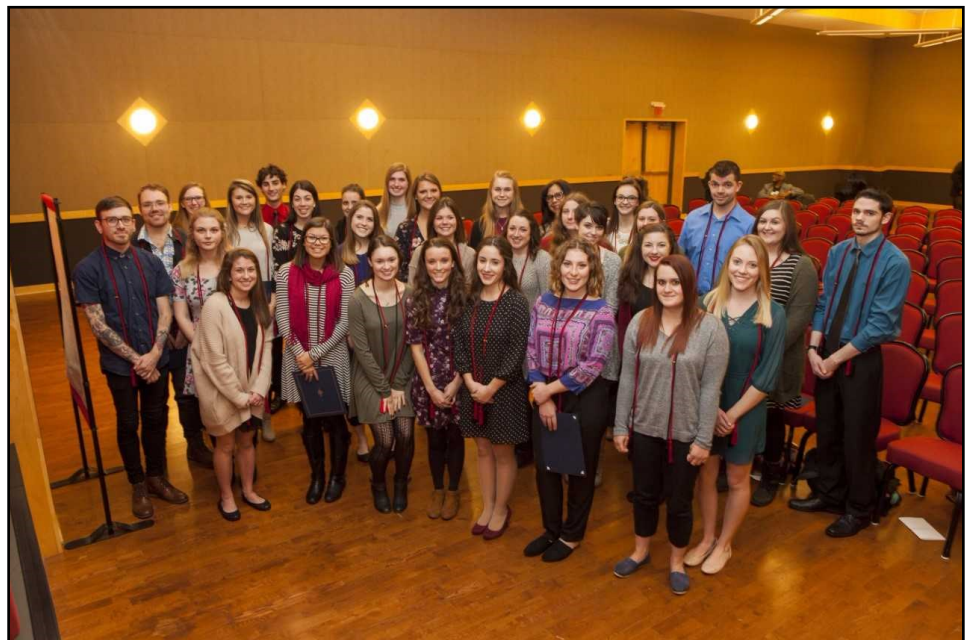
New Sigma Inductees

"The Sigma Tau Delta induction ceremony was the largest in the Alpha Epsilon Delta chapter's history, with 36 new members joining."