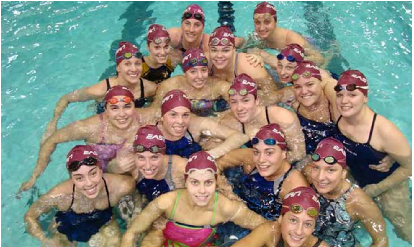
The women's swimming team finished third at the New England Swimming and Diving Championships, their best finish ever.