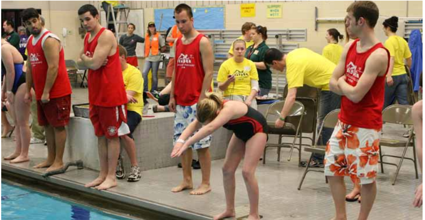
Eastern students have volunteered at the Windham Special Olympics swim meet since it began in 1979.