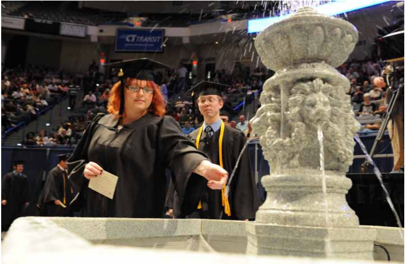
Graduates “Make A Wish” at Commencement 2010.

Developing a strong, collaborative connection between the University and its alumni is fundamental to Eastern achieving its vision as a premier public liberal arts university. During the past year, the Office of Alumni Affairs continued to build new, supportive relationships with alumni through a variety of receptions, meetings, reunions and events.