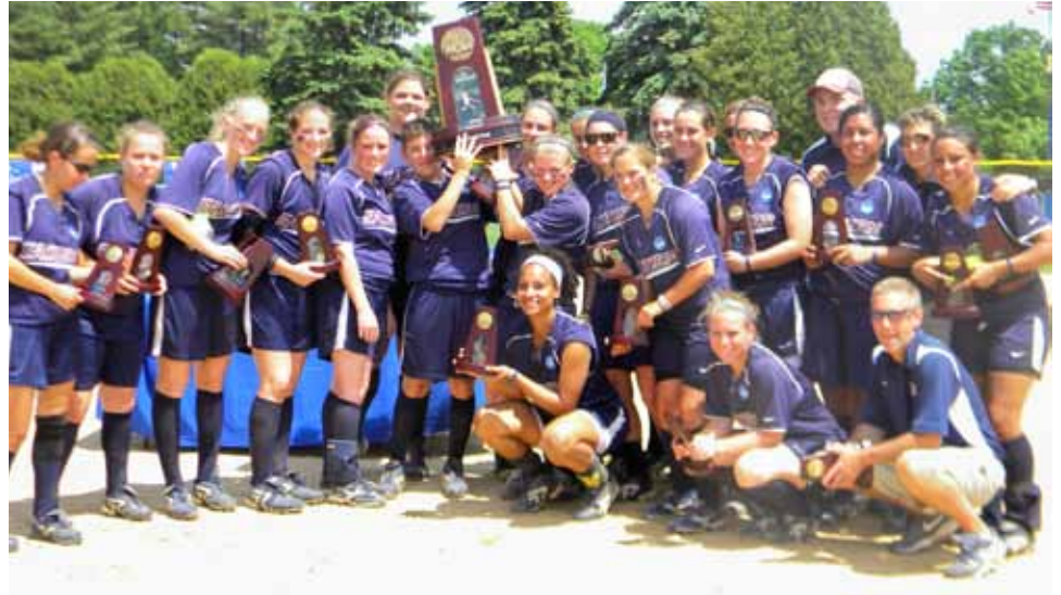
Eastern's softball team took home third place at the 2010 National Division III World Series.

In the spirit of Division III athletics and Eastern's liberal arts mission, the University is committed to developing the intellectual and physical talents of its student athletes. Eastern athletes had a stellar year in 2009–10, achieving success at the team and individual levels — both on the field and in the classroom.