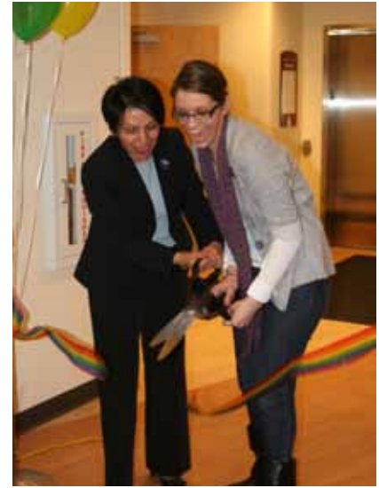
Eastern held a ribbon-cutting ceremony in February for the Pride Room, a new resource room for Eastern’s lesbian, gay, bisexual and transgender (LGBT) community.