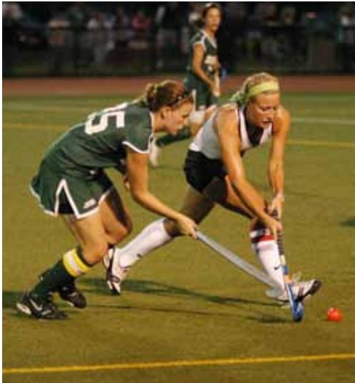
The women's field hockey team played the first game on Eastern's new artificial turf field in September 2009.

The $3.6 million, 8,500 square-foot facility houses offices for the chief of police, lieutenant and administrative assistant, and contains a community/conference and training room, holding cells and a central communications/control station that monitors all security and emergency systems for the campus.