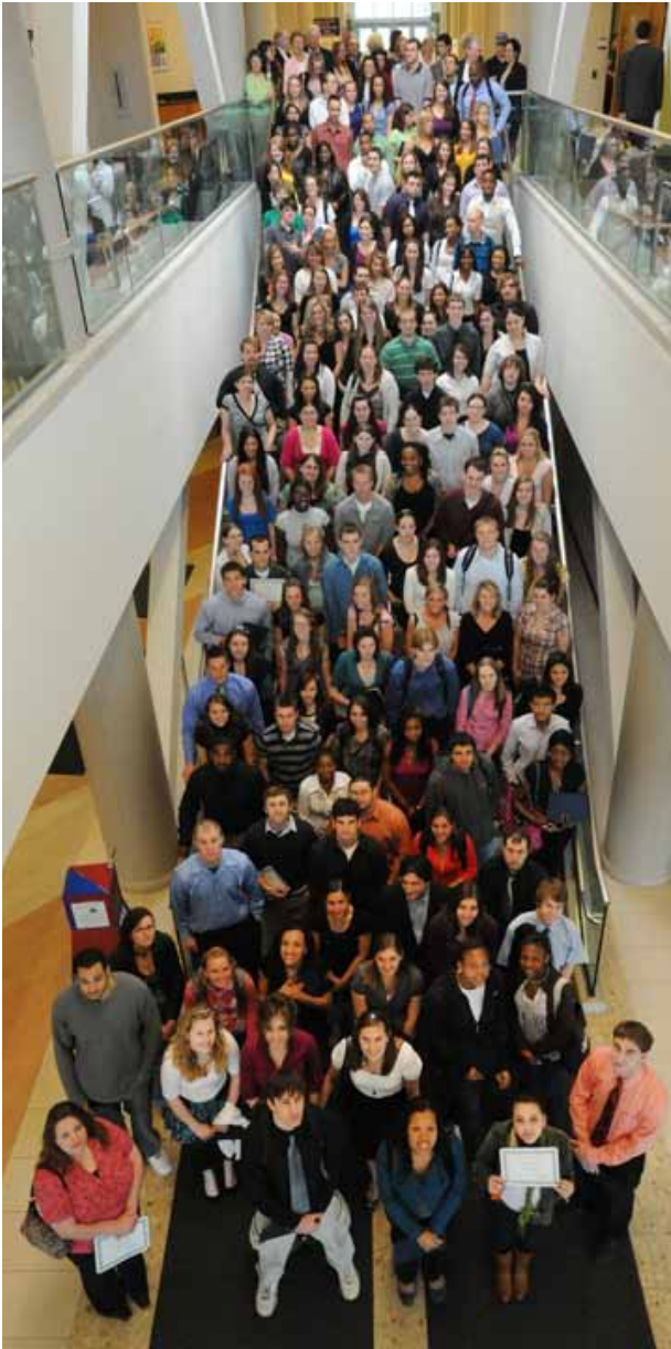
This past spring, even with difficult economic conditions, 280 students were named recipients of $334,000 in scholarship money during the ECSU Foundation, Inc.'s Annual Scholarship Reception.

Philanthropy remains a key element in Eastern's vision to become a University of First Choice. To continue to provide Eastern students with an exemplary, comprehensive liberal art experience, the University is focused on seeking more private funding to augment state support and tuition. Fundraising efforts focus on garnering financial and other support for private and public sources for the University, its programs, and its faculty and students.