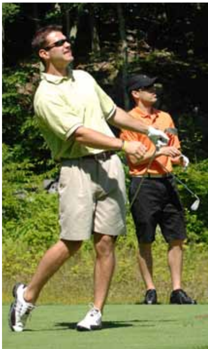
The ECSU Foundation, Inc.'s Annual Golf Tournament raised more than $76,000.

A total of 203 High Five pledges were received from the Class of 2010 in support of their class scholarship. This fiscal year Eastern also received 317 High Five pledges from young alumni (classes of 2000–2009). The classes of 2008 and 2009 have their own class scholarship and an Eastern Celebrates Scholarship was created for the other young alumni classes.