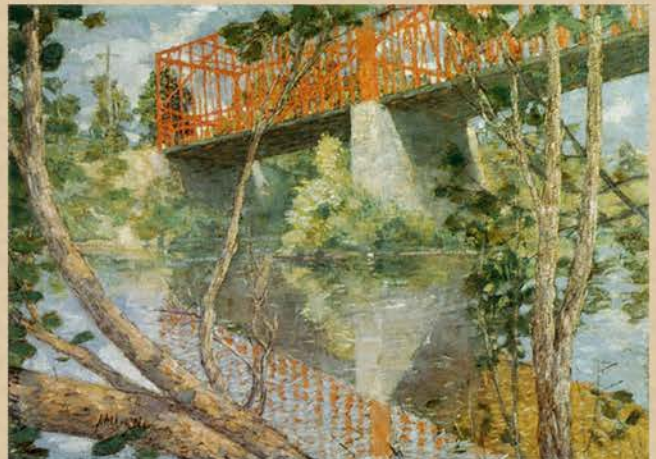
J. Alden Weir, The Red Bridge (1895) now owned by the Metropolitan Museum of Art Originally titled Iron Bridge at Windham