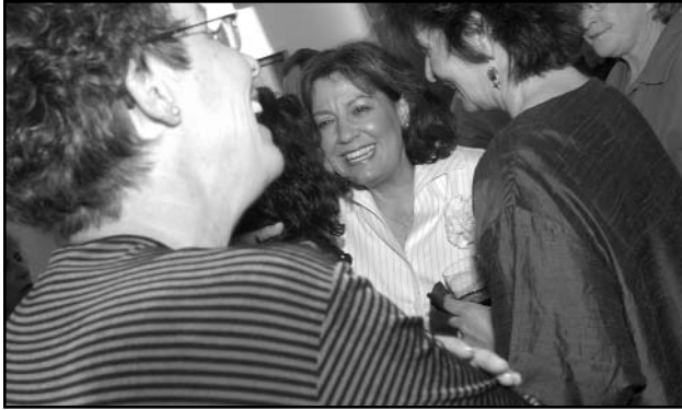
Classmates of '74 and '69 enjoy the All-Alumni Cabaret Night.