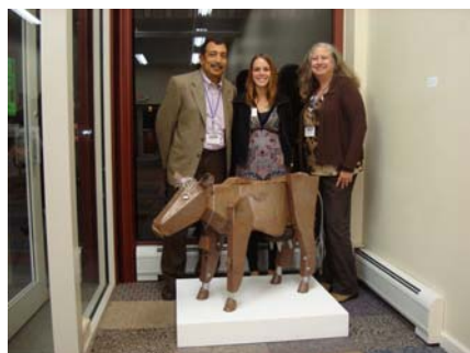
Church sculpted the cow shown above, while Pero constructed the moose, shown below.