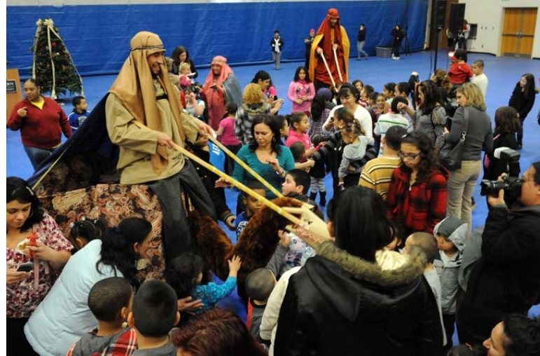
Above, the camels captivate local children, who eagerly join in a parade to dance to beautiful music produced by a blend of bongos, guiros, trumpets, guitars and keyboards.