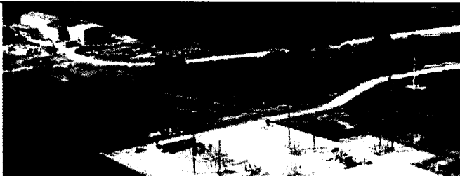
Aerial of Berri converter station & Monash sub station

This project is funded entirely by private investment. And early in its planning, Murraylink proved to regulators and the community that its unique features would minimise environmental, aesthetic and land impacts. Community support for the project was greatly enhanced by the decision to use under-