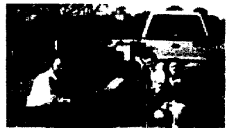
The LandCare wagon

Murraylink has created a major milestone in modern electricity transmission. And in the process set a high standard for professional consultations with Government, with Legislators and Agencies, and with the community in two States.