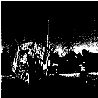
The old and the new - Murraylink underground cable rollout (foreground), with older style overhead cable lines behind

ground cables. No new right-of-ways, easements or resumptions involving private property were needed. Public land was used wherever possible.