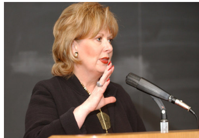
Pamela Wallin former Canadian Consulate General