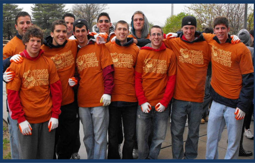
Men's soccer players and coaches volunteer their Saturday morning planting shrubs, landscaping and cleaning at Case Park.