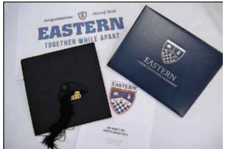
Commencement packages were mailed to ECSU graduates in advance of the ceremony. They included a diploma cover, two copies of the evening's program and their mortarboard and tassel.

Following the speeches, graduates listened to a musical recording while all the